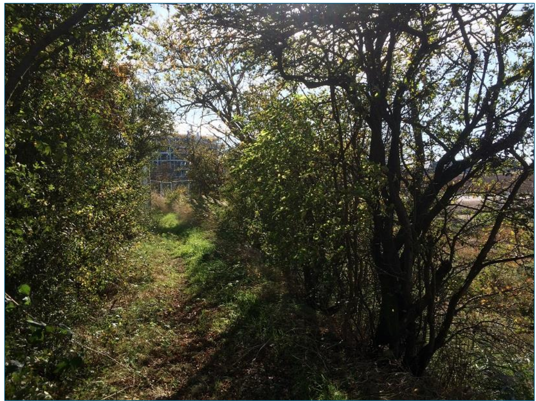
Plate A8.1.8 View from the Roman Bank. Biomass UK No. 3 Ltd directly ahead and the Application Site to the Right, Looking North-west

certain section of the bank, although it is partly masked by the dense hedgerow and the Biomass UK No. 3 Ltd structures ( Plate A8.1.8 ).