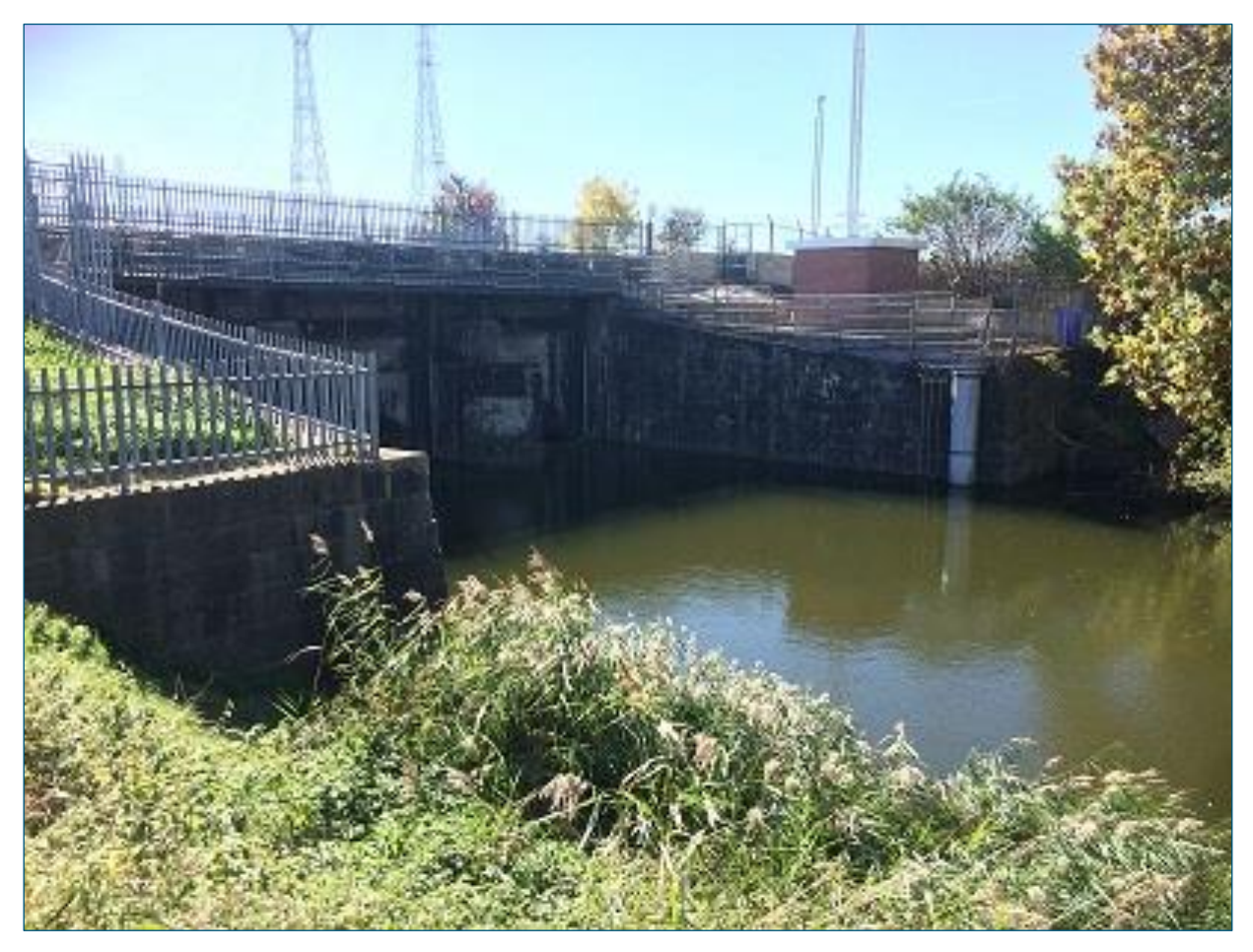
Plate A8.1.16 Maud Foster Sluice, view from Windsor Bank, Looking South-west