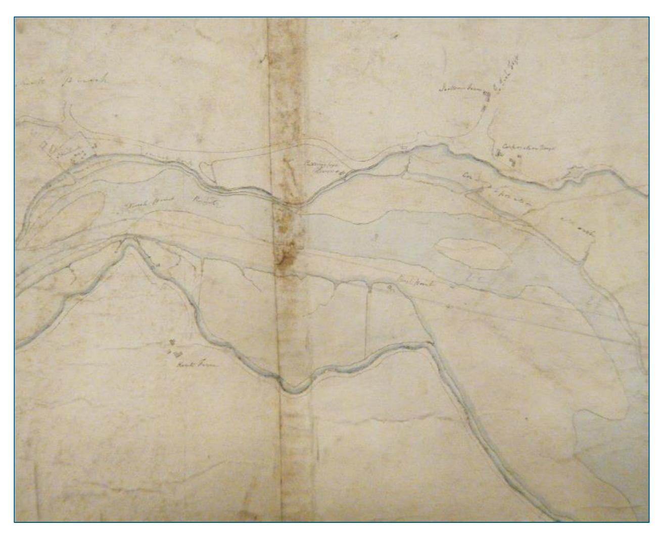
Plate A8.1.1 Map of The Haven, dated 1800. Note the 'Roman Bank' south of the river (LHER ref. PSJ/16/5/42).