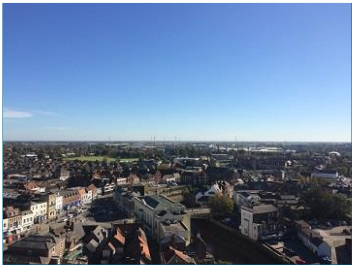
Plate A8.1.22 View from St Botolph's Church Tower; Application Site within Central Horizon (where Pylons are Visible)

the background and, when weather is clear, Lincoln Cathedral is visible on the horizon. The views south and east are predominantly more urban, with the majority of Boston located in the foreground and the Port of Boston visible in the midground. The Wash is also visible as well as a section of The Haven leading towards it.