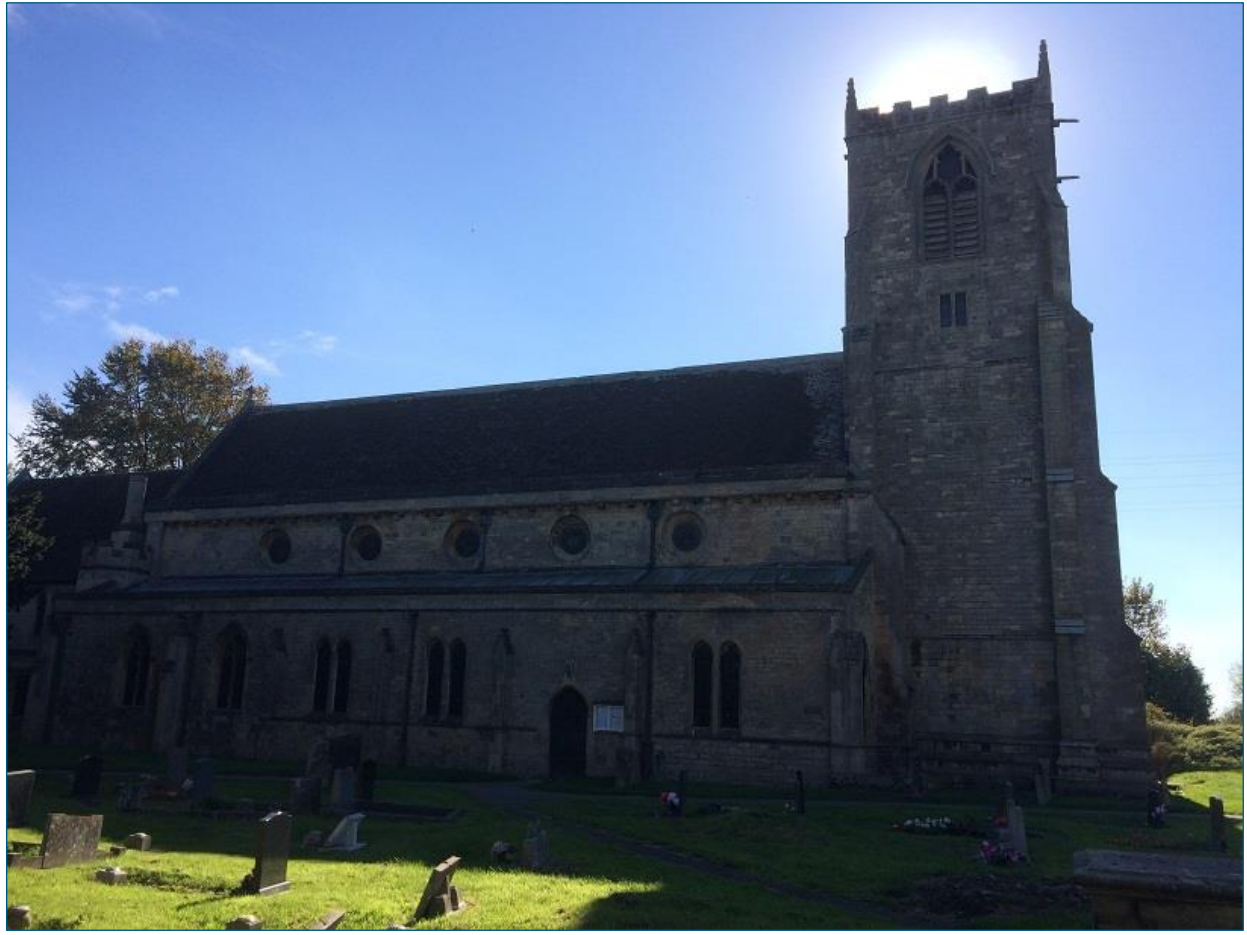
Plate A8.1.13 St Nicholas' Church, Skirbeck

A8.10.28Upon the site visit, it was noticeable that views to the Application Site were available from behind the church on the footpath (outside of the church's yard, but arguably within its setting). The wharf and stacks will be visible from this point behind the church. Outside of the churchyard, looking in, views to the church and its grounds will not be impacted by the Facility. As such, the impact is deemed to be moderate adverse .