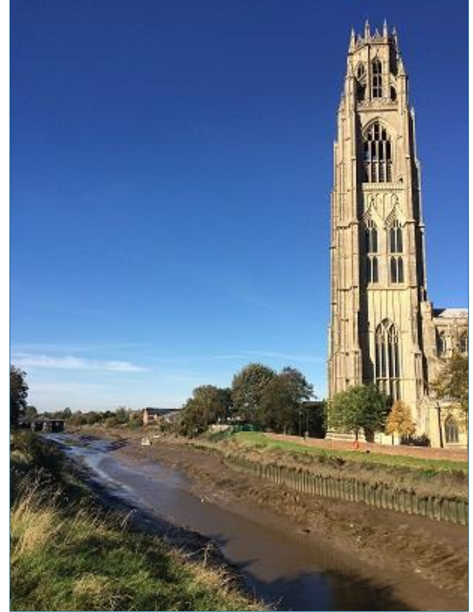
Plate A8.1.21 View of St Botolph's Church, Looking North, Adjacent to River Witham