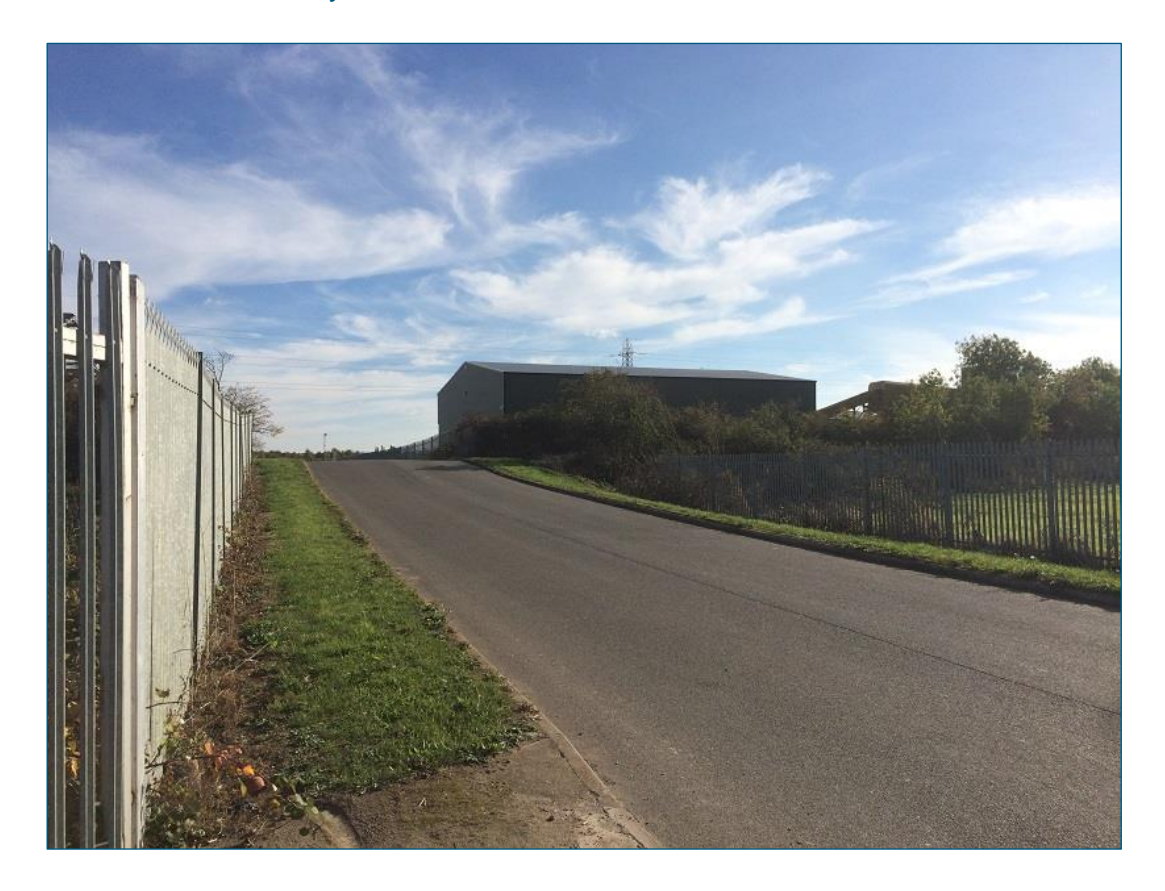
Plate A8.1.6 View of the Roman Bank and New Road Traversing over it, Looking East

slightly more open setting, although again, just south of the Application Site the bank is abutted by the old landfill site to the east.