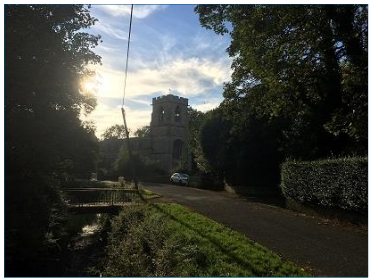
Plate A8.1.19 Views to the Church from the Road, Looking South-east