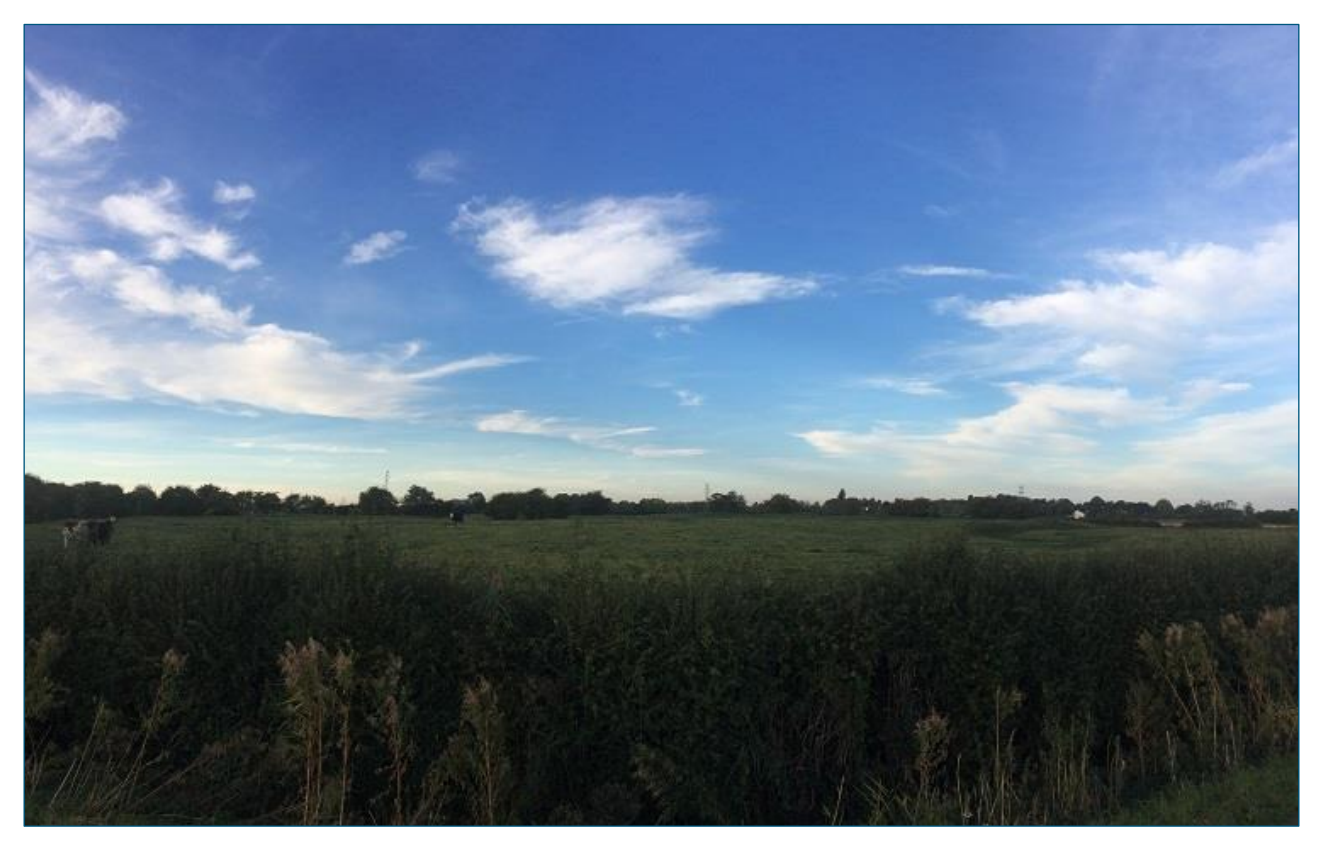
Plate A8.1.17 View into Wybert's Castle from the roadside

A8.10.49Views towards the industrial estate (to the north) are quite far reaching from the roadside ( Plate A8.1.18 ), whilst views towards the Stump are only partial, masked by tree cover and agricultural barns. Numerous power pylons are visible to the west and north, whilst farm buildings and industrial warehouses are also visible on the horizon.