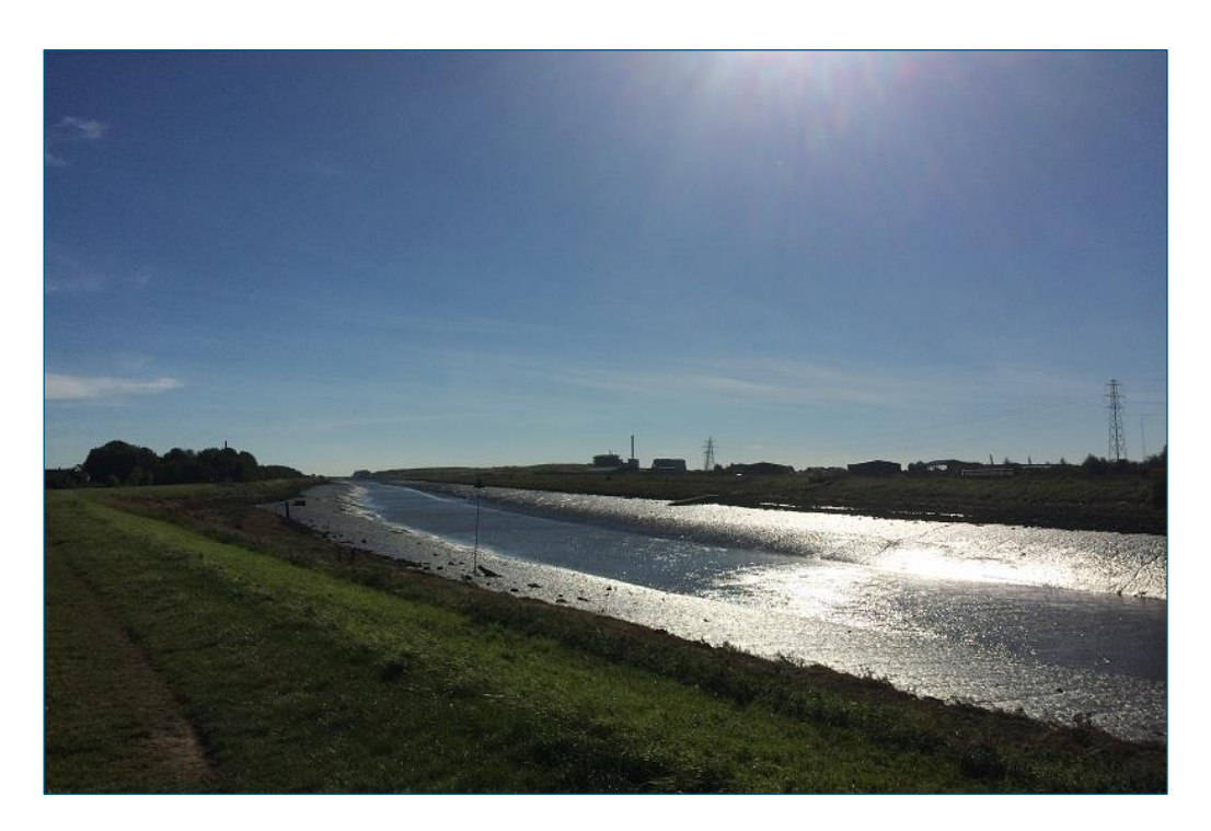
Plate A8.1.11 View from footpath south of the church, looking across The Haven towards Application Site

the church from this point, there is no clear view to the Boston Stump due to modern housing ( Plate A8.1.12 ).