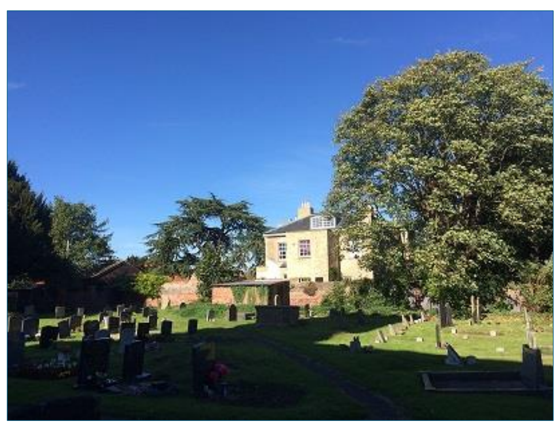
Plate A8.1.14 View to Skirbeck Hall from churchyard, looking east