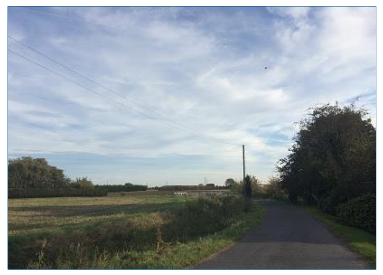
Plate A8.1.20 View towards the Application Site, after leaving the Conservation Area, looking eastnorth-east