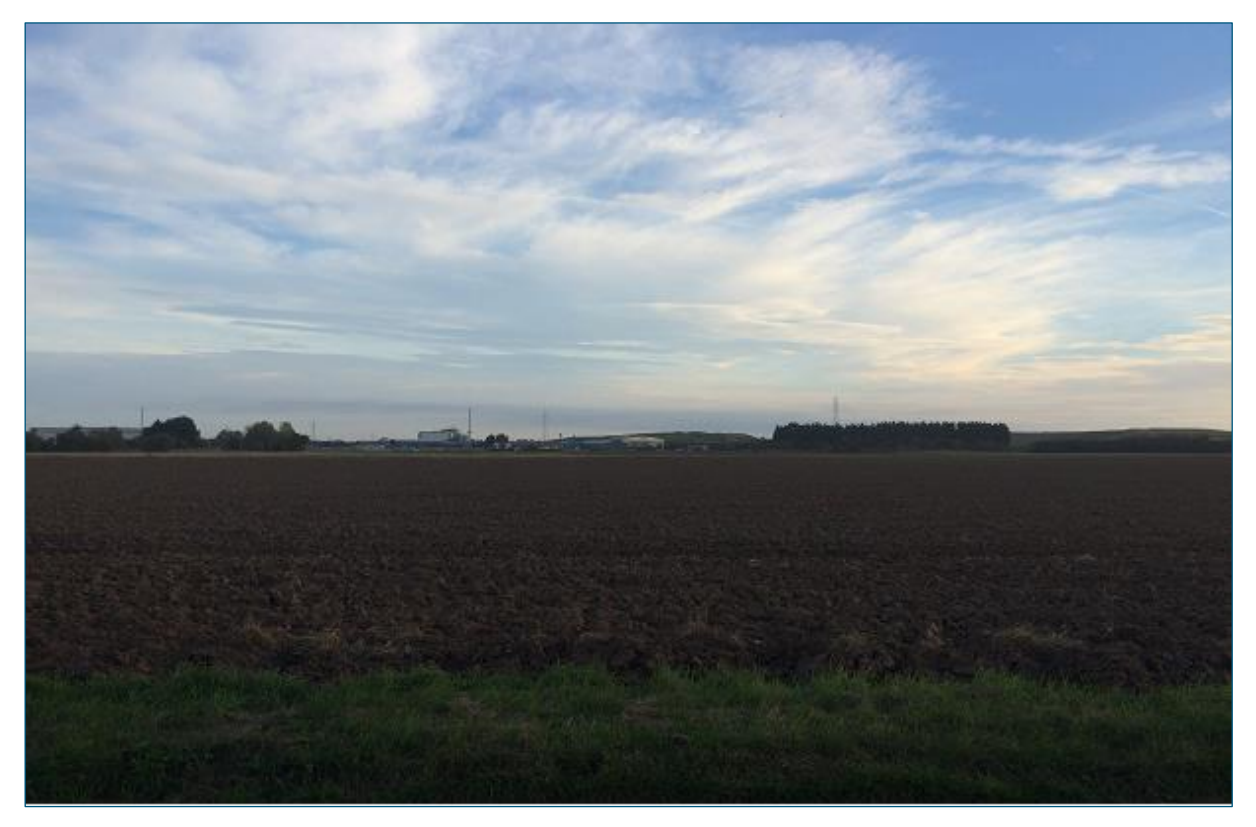
Plate A8.1.18 Views from the roadside looking north towards the Application Site