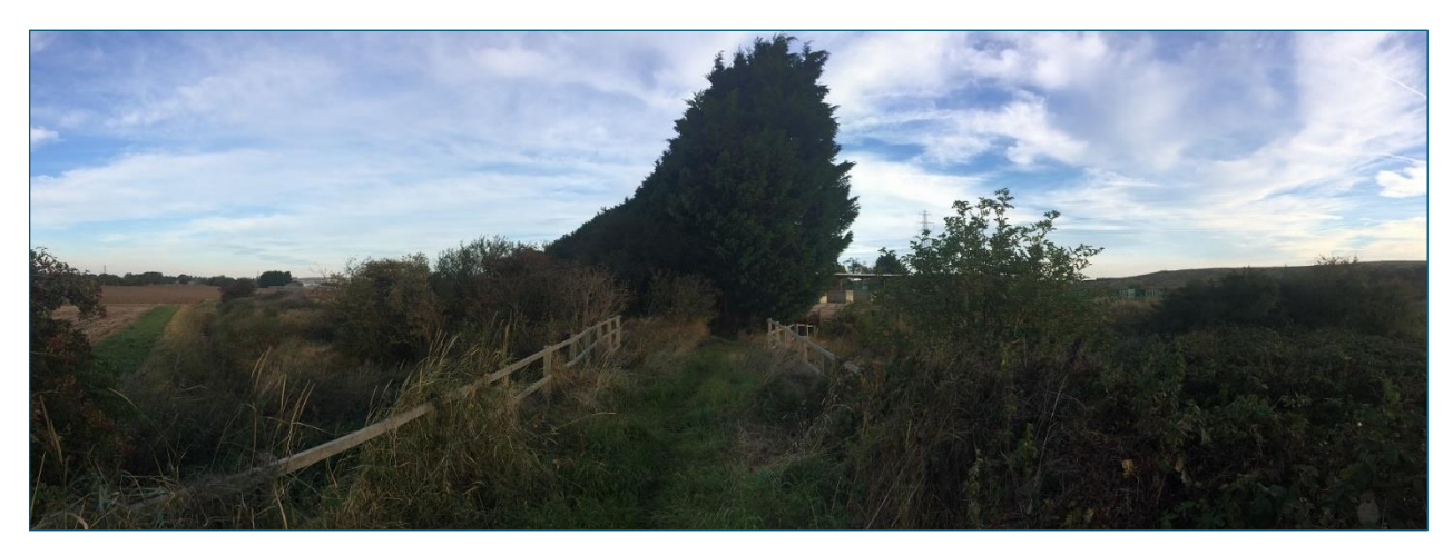
Plate A8.1.9 Approach to the sluice, from the south

A8.10.17Slippery Gowt Sluice is located directly south of the old Boston Landfill, access by a public footpath along the 'Roman Bank' at the southern-most end of the current industrial estate. Approach to the sluice is masked by a tall conifer treeline, which was planted to provide tree cover for the landfill. When the asset is reached, views of it are difficult ( Plate A8.1.9 ) and the sluice would easily be missed if not for an information board, which does aid in appreciation and interpretation of the asset's history. The area is overgrown, with scrub-growth located across the top of the brickwork; views of the structure are near impossible because of this overgrowth. Views out from the top of the sluice consist of a wide spanning view of the landfill northwards, whilst open farmland forms the view southwards, with a view to Frampton and its church spire noticeable on the horizon.