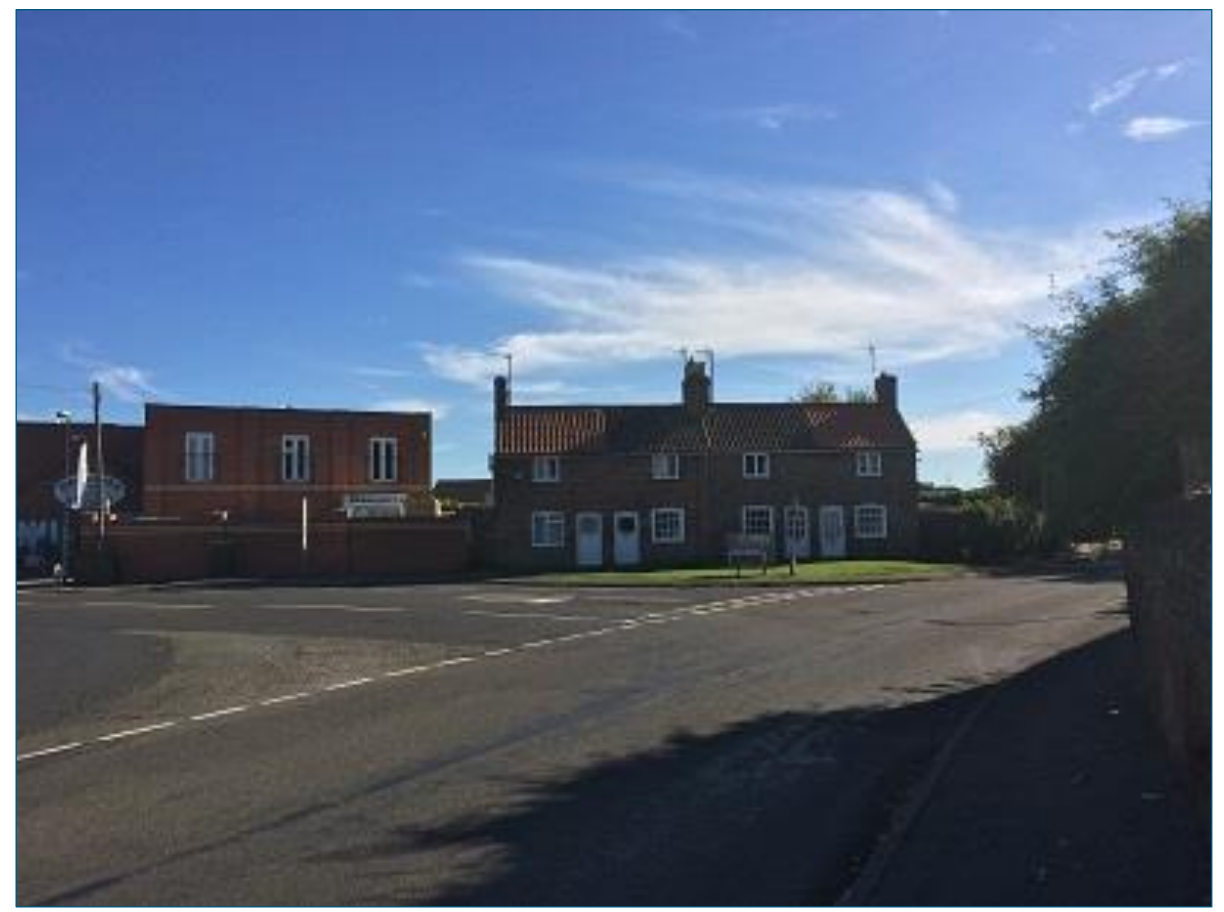
Plate A8.1.15 View to cottages from Fishtoft Road, looking north-east