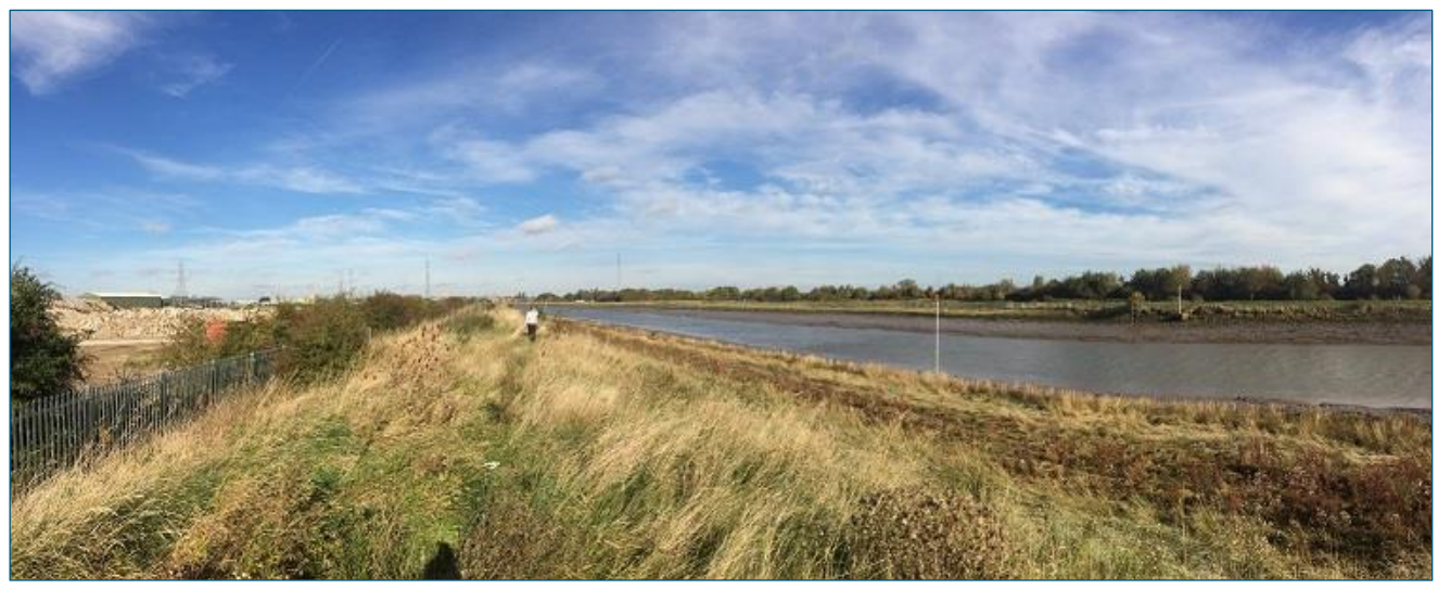
Plate A8.1.4 A View across The Haven from the Proposed Wharf, looking North