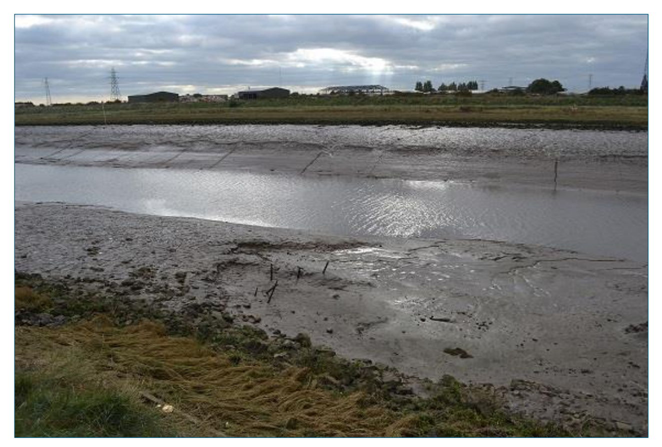
Plate A8.1.5 Stakes Revealed in the Mudflats during Low Tide, Looking South-west, Wharf Location Directly Ahead (Opposite Bank)