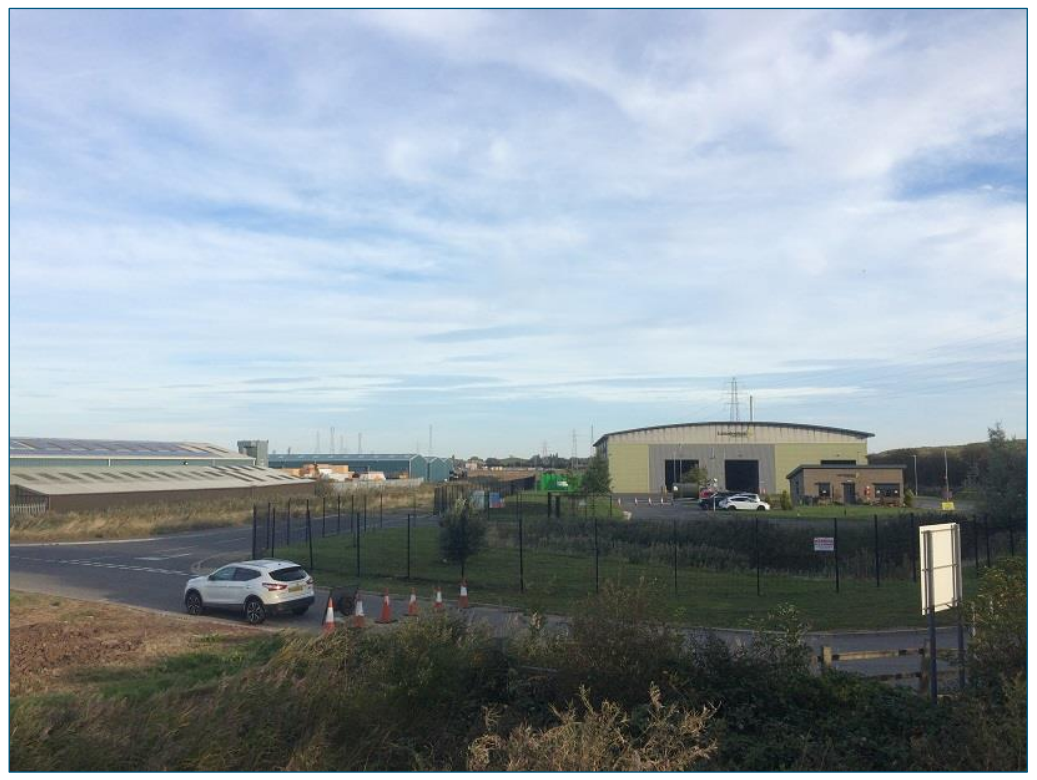
Plate A8.1.10 View to the Application Site and the Stump, after Leaving the Sluice

A8.10.19Intervisibility between assets is also a point for consideration, with Wybert's Castle located 600 m to the south-west. This view is looking away from the Facility, however, and visual connection is not strong, with limited visible evidence of Wybert's Castle from the sluice due to hedgerows blocking visibility. No views to the Application Site or Boston Stump are available whilst at the sluice, although both are visible after leaving the sluice, heading down the footpath north-westwards towards the industrial estate; the Stump is mostly masked by modern warehouses and the Slippery Gowt Transfer Station ( Plate A8.1.10 ).