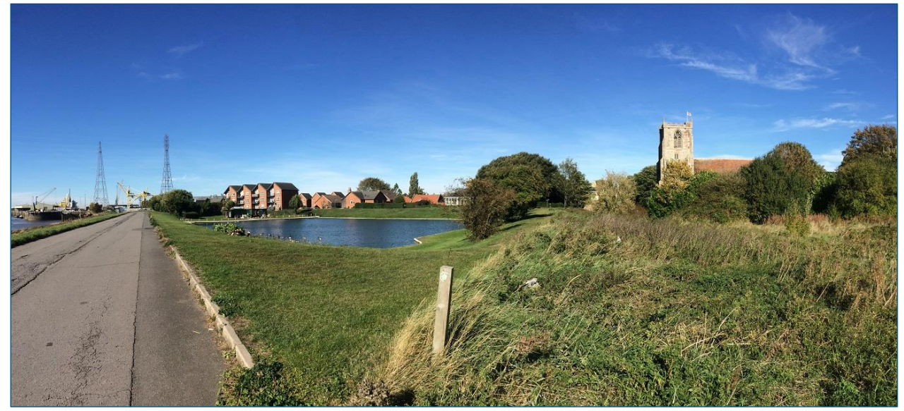
Plate A8.1.12 View from behind the Church, towards Boston Stump (not visible)

Plate A8.1.11 View from footpath south of the church, looking across The Haven towards Application Site