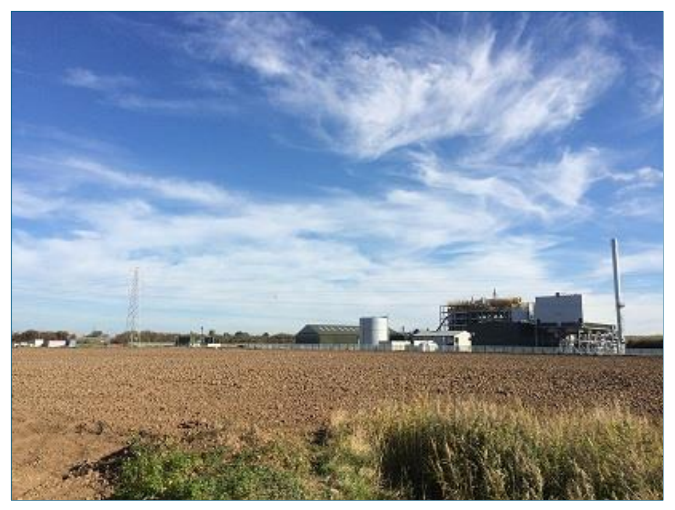
Plate A8.1.3 The Southern Fields, looking East. Biomass UK No. 3 Ltd in Right Mid-ground

A8.8.1 On 09/10/18, a walkover survey was conducted of the Application Site, to assess for any potentially unknown heritage assets and the potential for buried remains within the Application Site. The Application Site's southern half was laid to arable farmland, whilst the north-eastern half (nearest to The Haven) consisted of the floodbank, bounded by several arable fields as well as 'wasteland' areas containing scrub vegetation, dumps of construction rubble and other material. The southern fields had not been impacted by any modern development and had clearly been farmland throughout modern history. The areas of wasteland in the north-eastern half appear to have had some impact from modern development, but it appeared that this was limited in scale and buried remains (RHDHV95), if present, would survive.